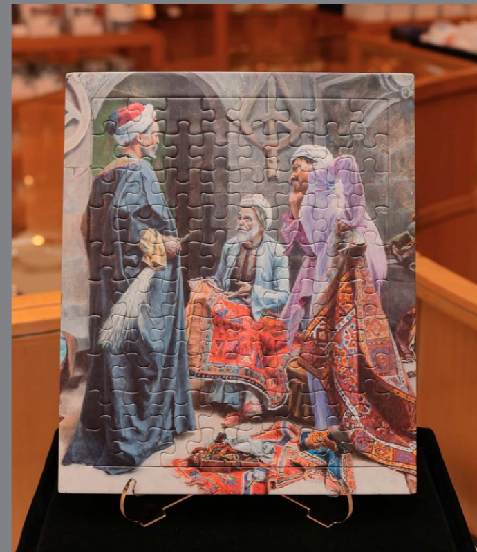
Jigsaw Puzzle Islamic Art (80 Pieces) Assorted Designs Code: 14000