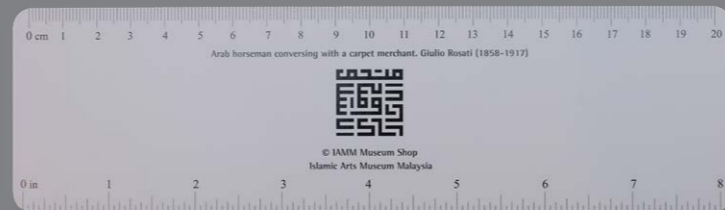
3D Lenticular Bookmark Ruler Assorted Designs Code: 32085