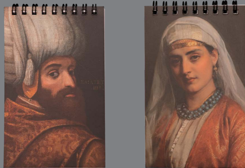
Small Notepad Orientalist Painting Assorted Designs Code: 32208a