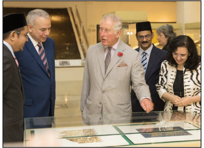
The Prince of Wales keenly discussing about IAMM's collection of the blue velvet in the Qur'an and Manuscripts Gallery with the Sultan of Perak, Sultan Nazrin Shah. .

The Prince of Wales's visit to the Islamic Arts Museum Malaysia was hosted by the Sultan of Perak, Sultan Nazrin Shah, who accompanied the Prince throughout the event. Prince Charles took almost an hour inside the museum, visiting the permanent galleries of Islamic Architecture, the Qur'an and Manuscripts, and attending a reception ceremony. His Royal Highness also had a chance to see artworks on display from students of his own school,