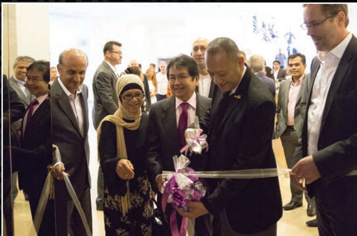
The ribbon cutting ceremony marks the opening of the exhibition to public.

The 'Faith Fashion Fusion: Muslim Women's Style in Australia' travelling exhibition was officially launched in a ceremony on 2 November 2017. It was officiated by the Minister of Tourism and Culture Malaysia, Datuk Seri Mohamed Nazri Abdul Aziz, and witnessed by Tan Sri Joseph Kurup, Minister at the Prime Minister's Office; the Director of Islamic Arts Museum Malaysia, Syed Mohamad Albukhary; and Australian High Commissioner to Malaysia, Rod Smith PSM.