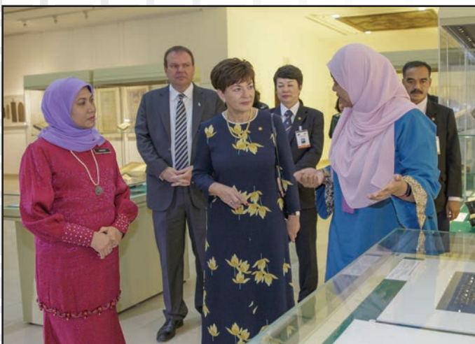
The Governor General of New Zealand, and her entourage enthusiastically listening to the explanation given by IAMM's Senior Curator during her recent visit.