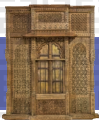
Front cover: Indian hardwood architectural facade from Gujarat, dated late 18th to early 19th century, collection of Islamic Arts Museum Malaysia.